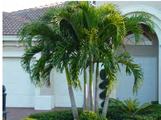
Christmas Palm 15' tall Medium shade to full sun, medium water, moderate growth.