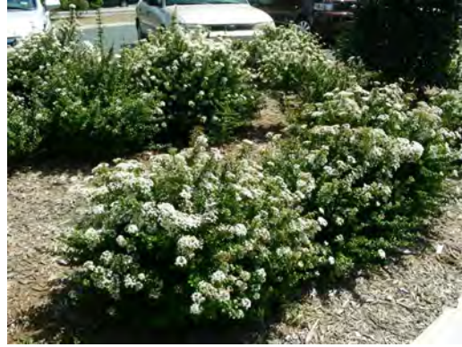
Walter's Viburnum 'Mrs. Schillers Delight' 3' tall, full sun to partial shade, moist soil.