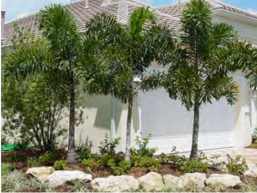
Foxtail Palm 30' tall Light shade to full sun, medium water, fast growth.