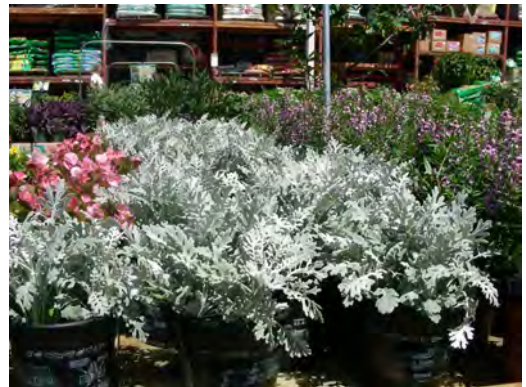
Dusty Miller Full sun to partial shade, salt tolerant. Plant October through March; space 6 to 12 inches apart.