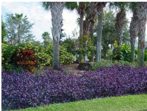
Purple Queen 6"-12" tall Light shade to full sun, low water.

Overwatering is the biggest error gardeners commit in Florida. This common practice shortens a plant's life, causes disease and increases the plant's maintenance requirements.