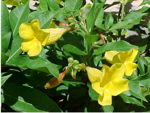
Allamanda 4'-5' tall Medium water, part shade to full sun (for more blooms).