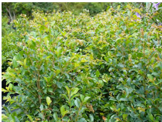
Eugenia 4'-6' tall, maintained as hedge. Part shade to full sun, low water.