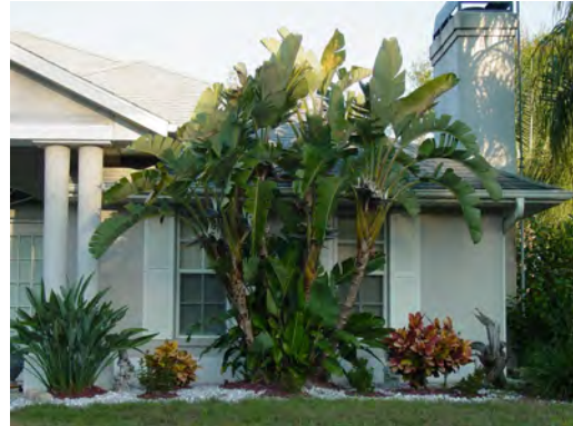
White Bird of Paradise 10'-15' tall Full sun to medium shade, low water.