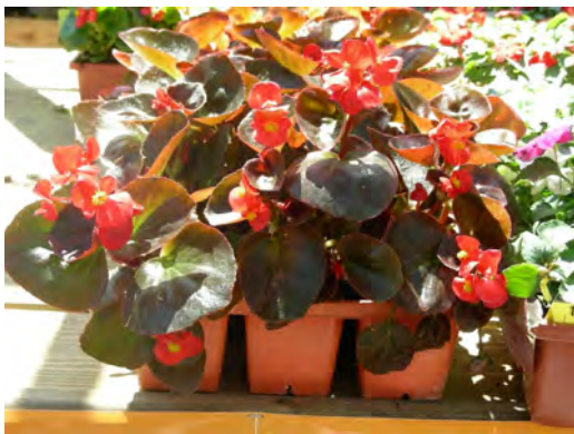
Begonia Full sun to partial shade, medium salt tolerance. Plant October through March; space 6 to 12 inches apart.