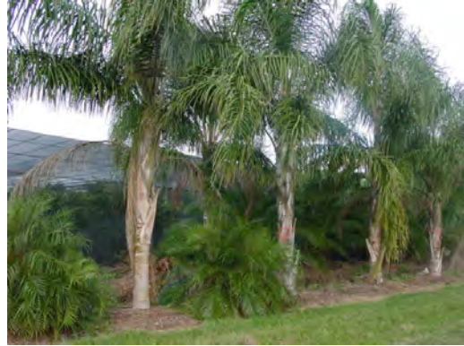
Queen Palm 30-40' tall Light shade to full sun, low water, fast growth.