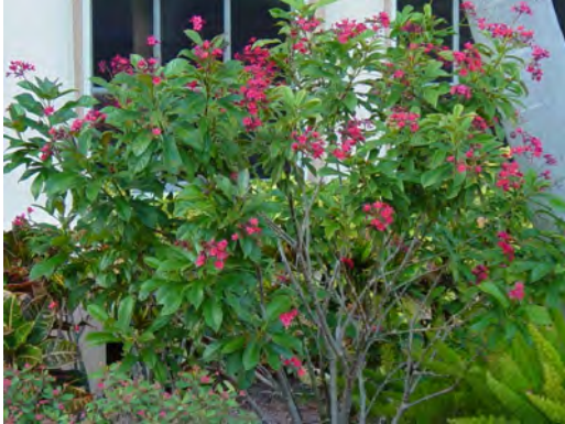
Jatropha large shrub or small 8'-10' tree. Light shade to full sun (blooms best). Low water, attracts butterflies.