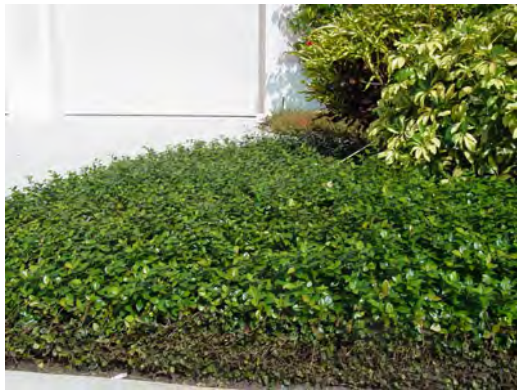
Jasmine 'Minima' 8" tall Full sun, likes moisture.