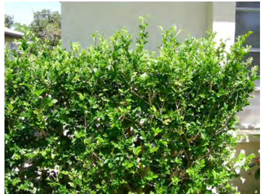
Jasmine 'Lakeview' Use as a shrub or small tree. Maintain shrub at 3'-4' tall (good for hedges). Light shade to full sun, low water.