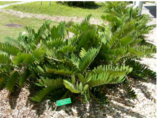
Cardboard Palm 4'-5' tall Medium shade to full sun, low water, slow growth.