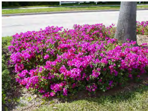
Bougainvillea 'Helen Johnson' 2' tall Full sun, low water, good drainage.