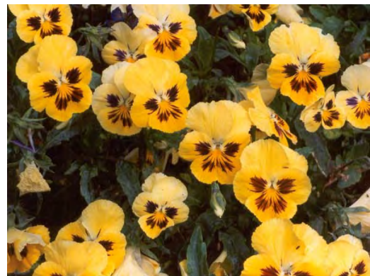
Pansy Light shade to full sun, medium salt tolerance. Plant November through December; space 6 to 12 inches apart.