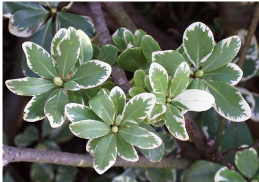
Variegated Pittosporum 3'-4' hedge Full sun to light shade, low water. Should be hand pruned.