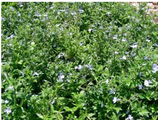
Lobelia Full sun to partial shade. Plant October through February; space 6 to 12 inches apart.