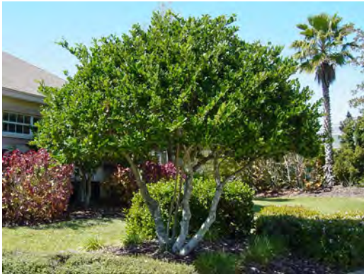
Ligustrum 15'-20' tall Full sun to light shade, medium water.