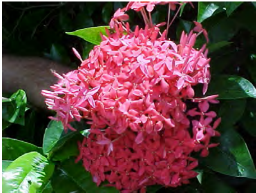
Ixora 'Nora Grant' flower