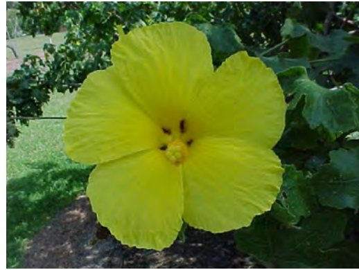
Hibiscus 4'-5' tall Light shade to full sun, medium water.