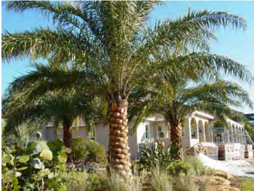
Wild Date Palm (Phoenix sylvestris) 30' tall Full sun, low water, slow growth.