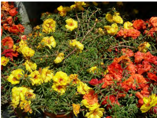
Portulaca (Moss Rose) Full sun, high salt tolerance. Plant March through May; space 1 to 1.5 feet apart.