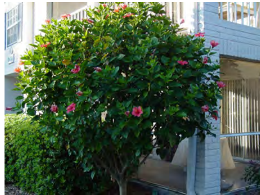
Hibiscus Standard 6'-8' tall Light shade to full sun, medium water.