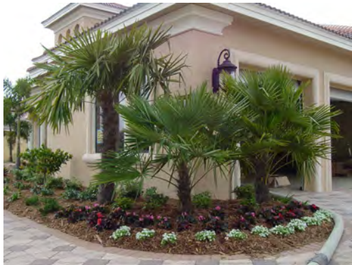
Windmill Palm 20' tall Full sun to light shade, low water, slow growth.