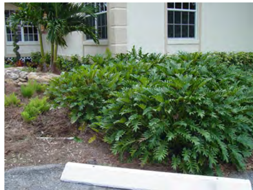
Philodendron 'Xanadu' 3' to 4' tall Medium shade to full sun, low water.