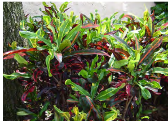
Croton 'Mammy' 2'-3' tall Part shade to full sun, low water.