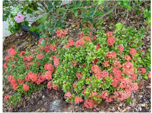
Ixora 'Petite Red' Dwarf 2 -2 1/2' tall Light shade to full sun, medium water.