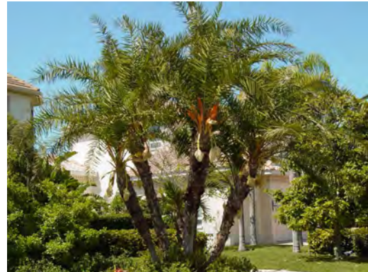
Phoenix reclinata 25'-30' tall Full sun, low water, moderate growth.