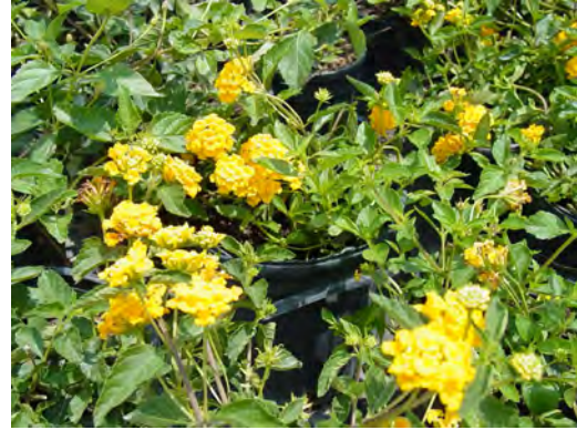
Lantana Yellow 8"-12" tall Full sun, medium water.