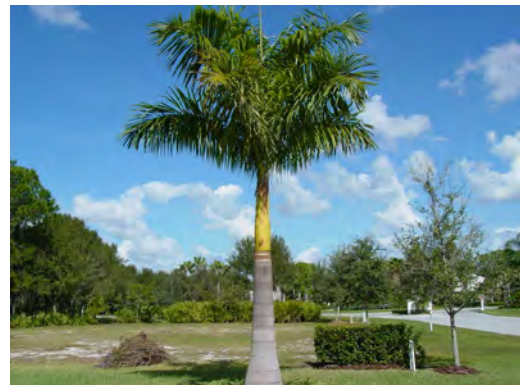
Royal Palm 50'-60' tall Full sun, medium water, moderate growth.