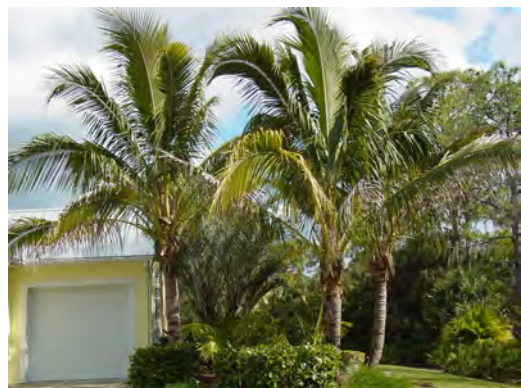
Coconut Palm 30' tall and higher Full sun, low water, moderate growth.