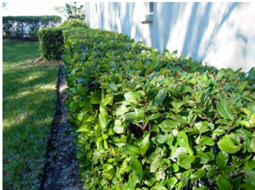
Viburnum suspensum 3'-4' tall maintained as hedge. Medium shade to full sun, low water.