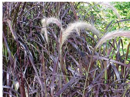
Fountain Grass Red 3'-4' tall Full sun, low water.