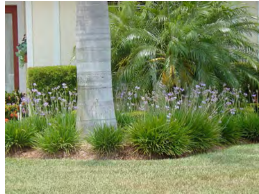
Society Garlic 18"-24" tall Full sun, low water.