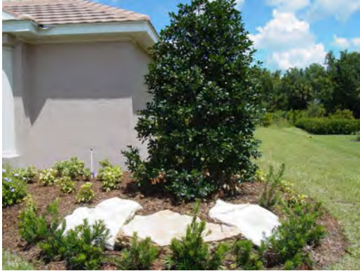
'Nellie Stevens' Holly 20'-30' tall Full sun to light shade, low water.