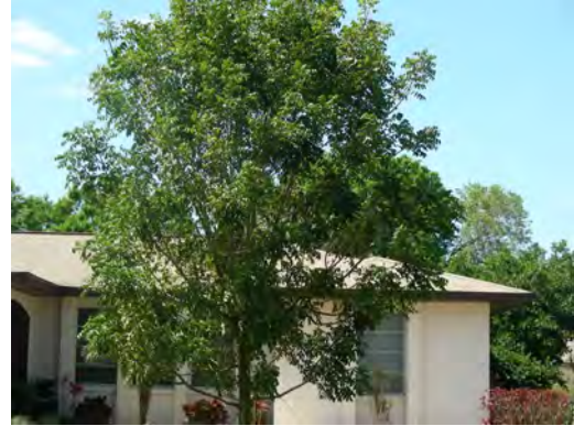
Mahogany 30' tall and higher Full sun, low water, native.