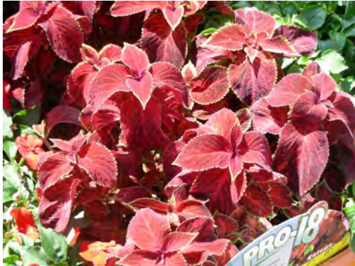
Coleus Partial shade, medium salt tolerance. Plant March through September; space 1 to 2 feet apart.