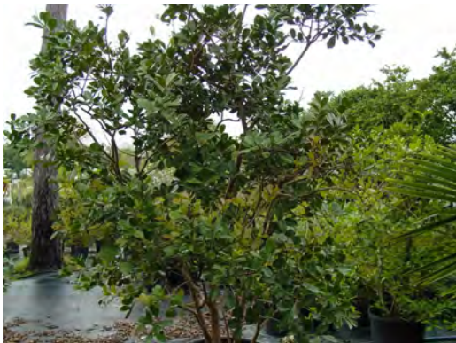
Cattley Guava 10'-15' tall Gray/brown bark, full sun to part shade, low water, messy but edible fruit.