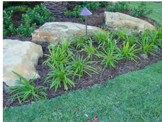
Lily of the Nile 18"-24" tall Light shade to full sun, medium water.