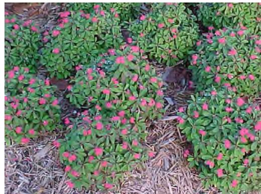
Dwarf Crown of Thorns 18"-24" tall Full sun, low water.