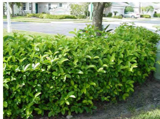
Sweet Viburnum Maintain as a hedge 3'-4' tall. Full sun to light shade, low water.