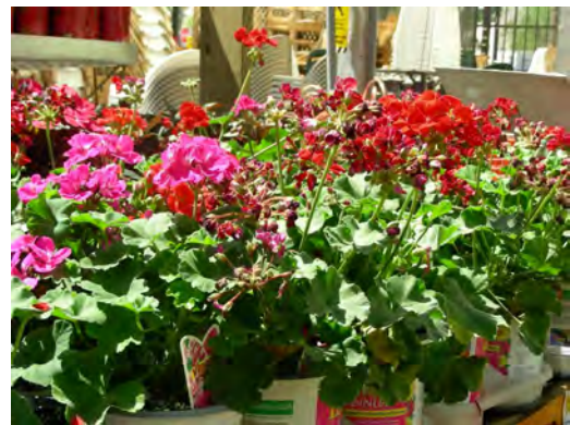
Geranium Full sun to partial shade, high salt tolerance. Plant October through March; space 1 to 1.5 feet apart.