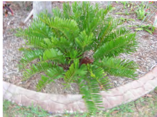
Coontie 2'-4' tall Low water, full sun to part shade, native.