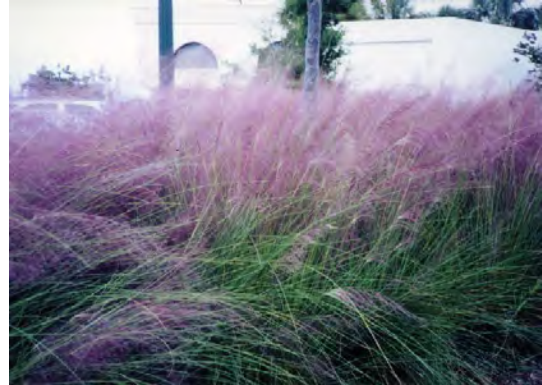
Muhly Grass 3'-5' tall Full sun, tolerates drought and poor drainage. Showy in fall. Native.