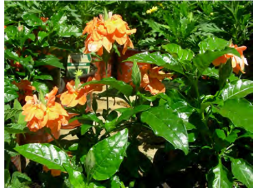
Crossandra Full sun to partial shade. Plant March through September; space 1 to 1.5 feet apart.