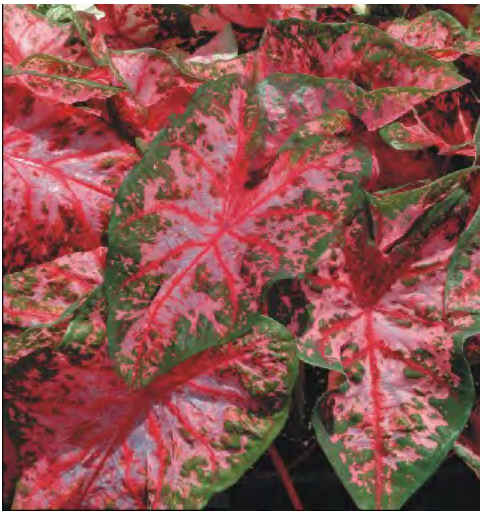
Caladium Medium shade to full sun. Plant March through August; space 1 to 1.5 feet apart.