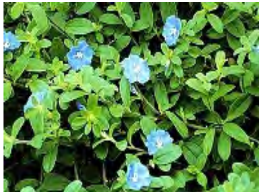
Blue Daze 12" tall Medium water, light shade to full sun.