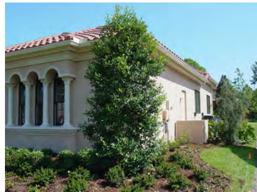
'East Palatka' Holly 30'-35' tall Full sun to light shade, low water, red berries.