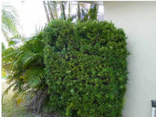
Podocarpus Easy to maintain at different hedge heights. Light shade to full sun, medium water.