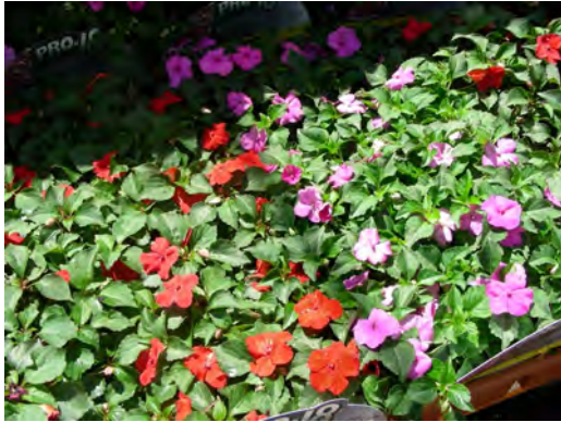
Impatiens Medium shade to full sun, medium salt tolerance. Plant October through February; space 1 to 1.5 feet apart.