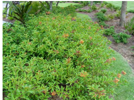
Firebush Dwarf 4'-5' tall Drought tolerant, full sun to shade, attracts butterflies.