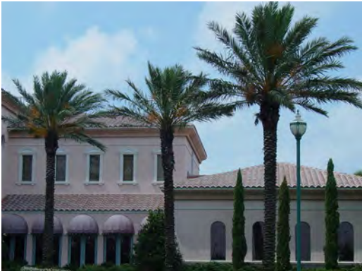
Phoenix 'Medjool' 70' tall Full sun, low water, slow growth.