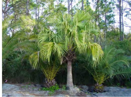
Chinese Fan Palm 25'-30' tall Medium shade to full sun, low water, slow growth.