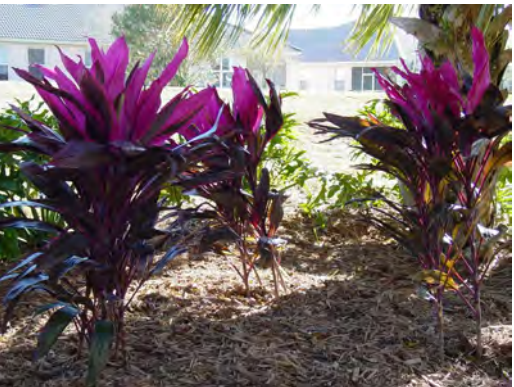
Hawaiian Ti 'Red Sisters' 4' tall Medium shade, medium water.