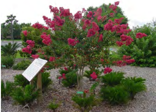
Crepe Myrtle 15'-25' tall Full sun, low water, summer flowers, deciduous.