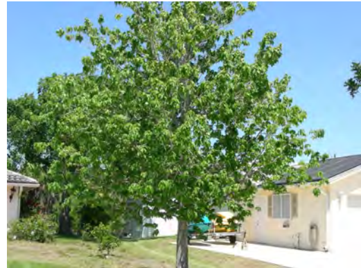
Red Maple 70' tall Full sun, adaptable to wetlands and dry environments. May show color during cold winters. Native and deciduous.