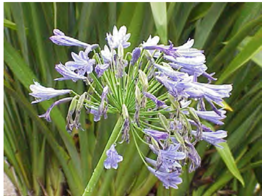
Lily of the Nile flower