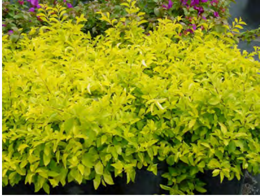
Gold Mound Duranta 2' tall Light shade to full sun, medium water.