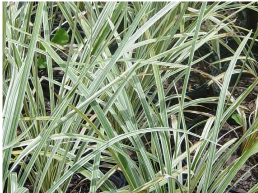
Aztec Grass (Var. Liriope) 12"-24" tall Dense shade to full sun, low water.