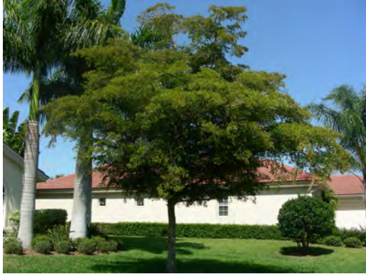
Black Olive 'Shady Lady' 25' tall Full sun, low water.