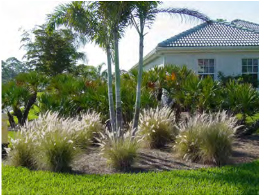
Fountain Grass White 3'-4' tall Full sun, low water.