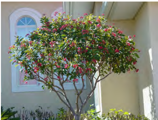
Jatropha makes a nice accent tree at 8'-10' tall. Blooms year round.