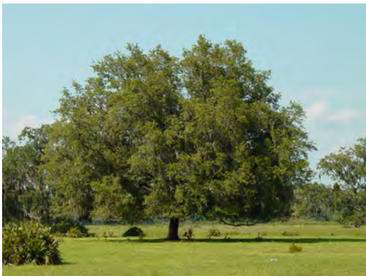
Live Oak 40'-50' tall Full sun to light shade, low water, partially deciduous.