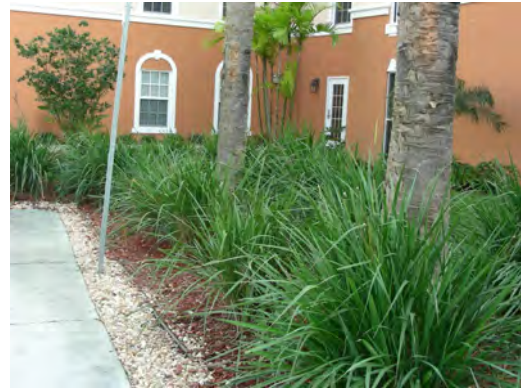
Fakahatchee Grass 2'-3' tall Moist soil, part shade to full sun (pond banks).