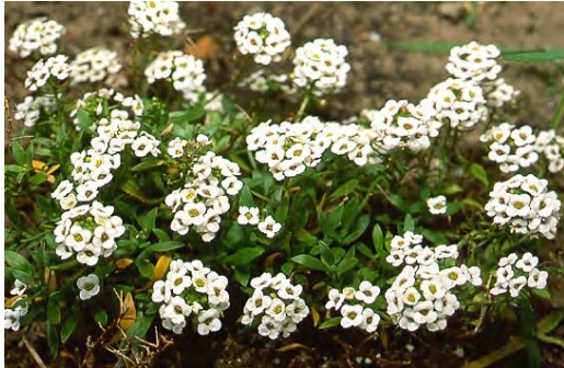
Alyssum Full sun to partial shade. Plant October through February; space 6 to 12 inches apart.