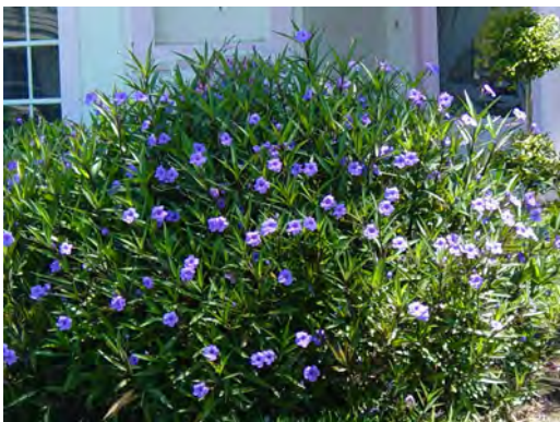
Mexican Petunia Maintain at 3' tall. Light shade to full sun, medium water.