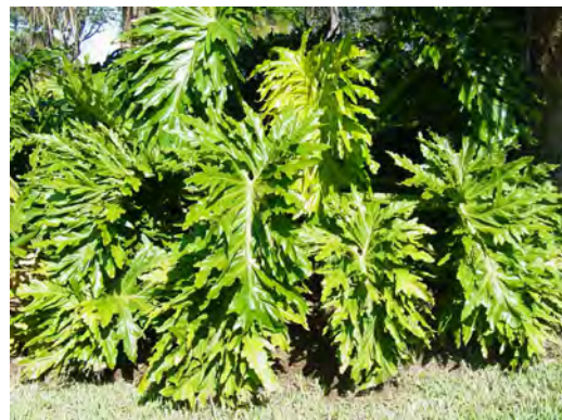
Philodendron Selloum 6'-8' tall Full sun to full shade, low water.