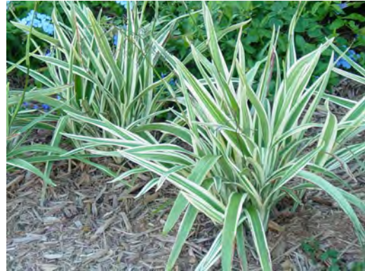
Blue Flax Lily 3' tall Part shade, moist soil.