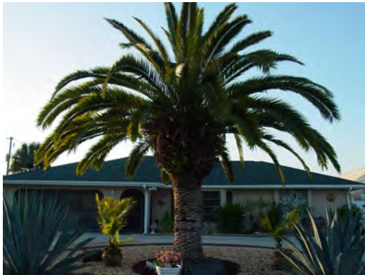
Canary Island Date Palm 40' tall Full sun, low water, slow growth.