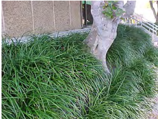
Liriope 'Evergreen Giant' 12"-24" tall Dense shade to full sun, low water.