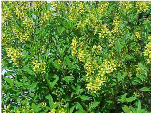
Thyallis Maintain at 4'-6' tall. Full sun to light shade, medium water.