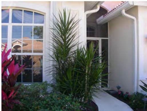
Dracaena 'Red Edged' 5'-6' tall Part shade to full sun, low water.