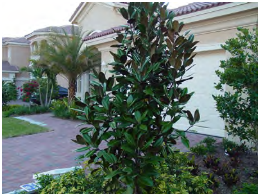
Southern Magnolia 50' tall and higher Full sun or light shade, moderate water, native. Smaller varieties available.