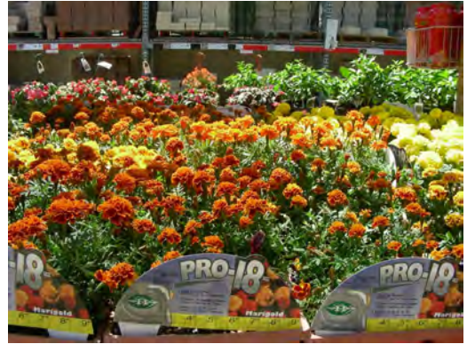
Marigold Full sun, medium salt tolerance. Plant October through March; space 1 to 1.5 feet apart.