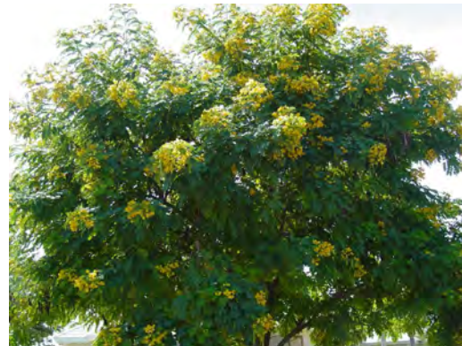
Glaucous Cassia 10'-15' tall Full sun to light shade, low water, winter flowers.