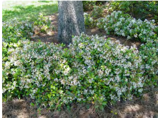
Indian Hawthorne 2 1/2'-3' tall Part shade to full sun, low water.