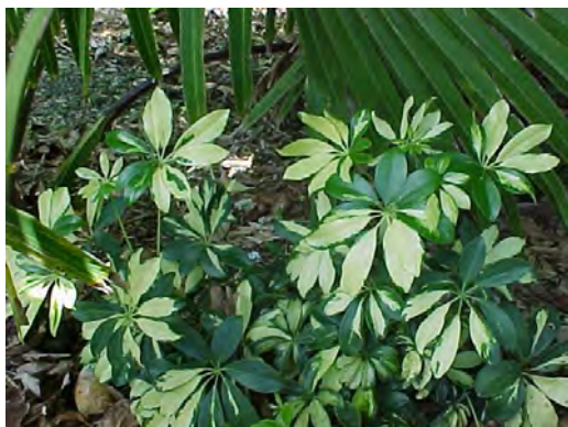
Schefflera 'Trinette' Maintain 2'-3' tall. Dense shade to full sun, low water.