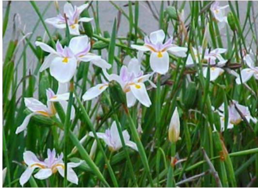
African Iris 2' tall Low water, full sun to part shade.

Serving Sarasota, Manatee and Charlotte counties since 1990