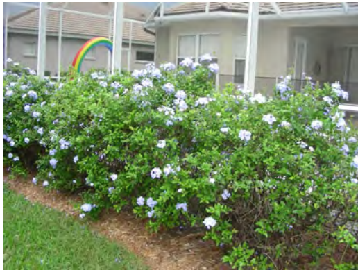
Plumbago Maintain 3'-4' tall. Light shade to full sun, low water.