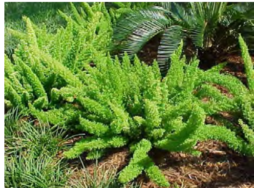
Foxtail Fern 12"-18" tall Part shade to full sun, low water.