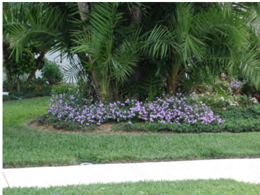
Lantana Purple 8"-12" tall Full sun, medium water.