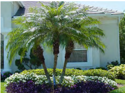
Pygmy Date Palm 10'-12' tall Medium shade to full sun, low water, slow growth.