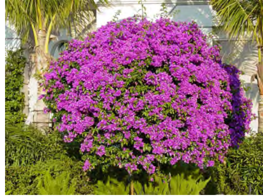
Bougainvillea 'New River' 5' tall and up Full sun, low water, good drainage.