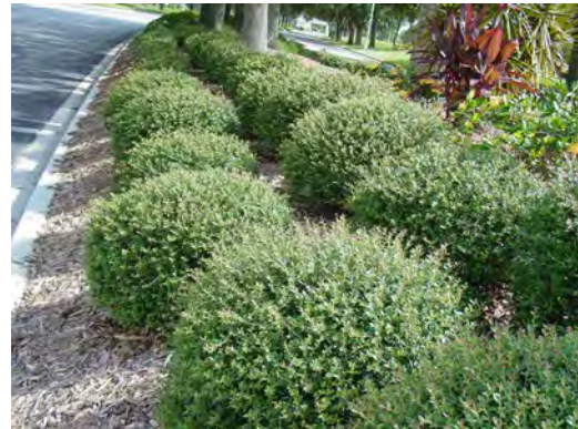
'Stokes' Dwarf Holly 2'-3' tall Full sun or light shade, low water.