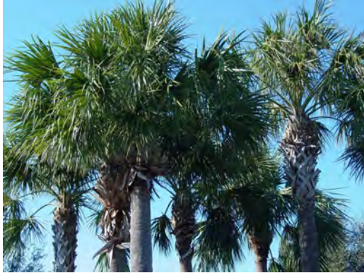
Cabbage Palm 30'-40' tall Full sun, low water, slow growth, native.