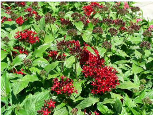
Penta Light shade to full sun. Plant March through September; space 1 to 1.5 feet apart.