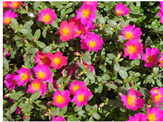
Purslane Full sun, high salt tolerance. Plant May through November; space 10 to 12 inches apart.