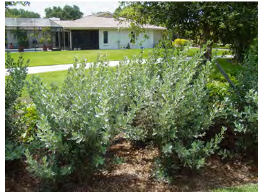
Silver Buttonwood Hedge 3'-4'; accent 5'-6'. Full sun, low water, native.