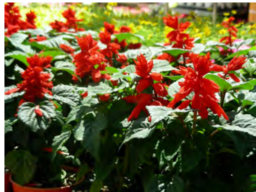
Salvia Full sun to partial shade, medium salt tolerance. Plant February through November; space 8 to 12 inches apart.