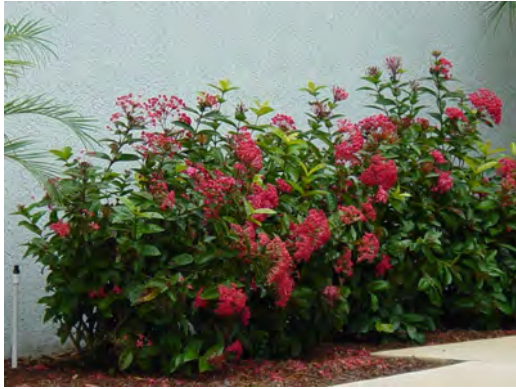
Ixora 'Nora Grant' Maintain 3'-4' tall for best blooming. Light shade to full sun, medium water.