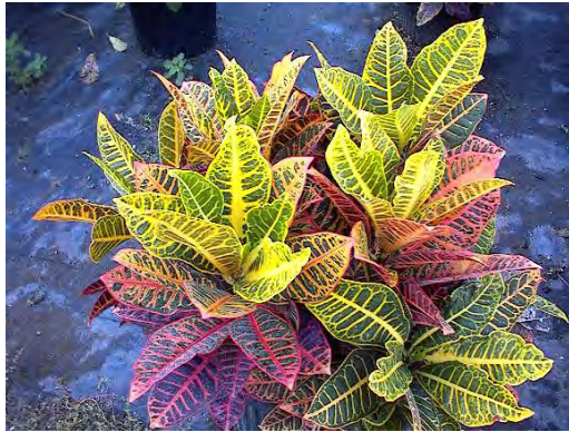
Croton 'Petra' 3'-4' tall Low water, part shade to full sun (fades in full sun).