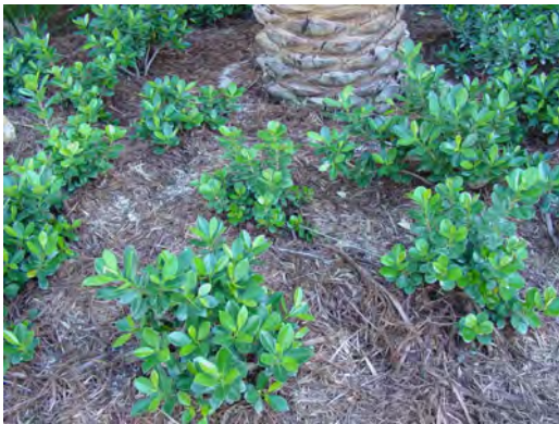
Green Island Ficus 2 1/2" - 3' tall Part shade to full sun, low water.