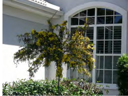
Desert Cassia 8'-10' tall Full sun to light shade, low water, winter flowers.