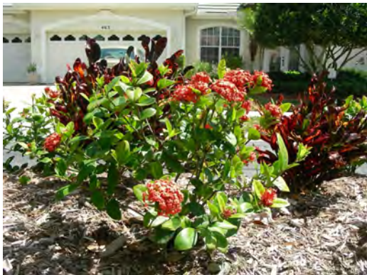
Ixora Maui Red Maintain 3'-4' tall for best blooming. Light shade to full sun, medium water.