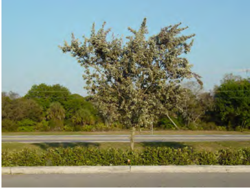
Silver Buttonwood 15'-20' tall Full sun, low water, native.